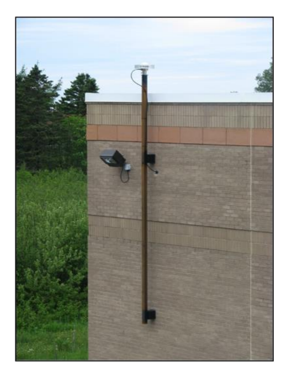
Figure 6: Antenna mast attached to a load bearing wall

Despite having metal siding, the building in Figure 8 has a concrete inner wall. The antenna mast is mounted to the concrete inner wall using through bolts (Figure 9).