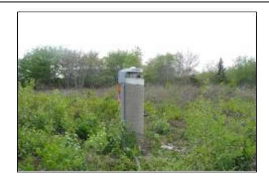
Figure 4 : Ground based, concrete pillar monument