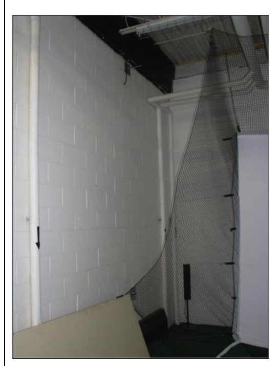
Figure 7: Through bolts for mounting