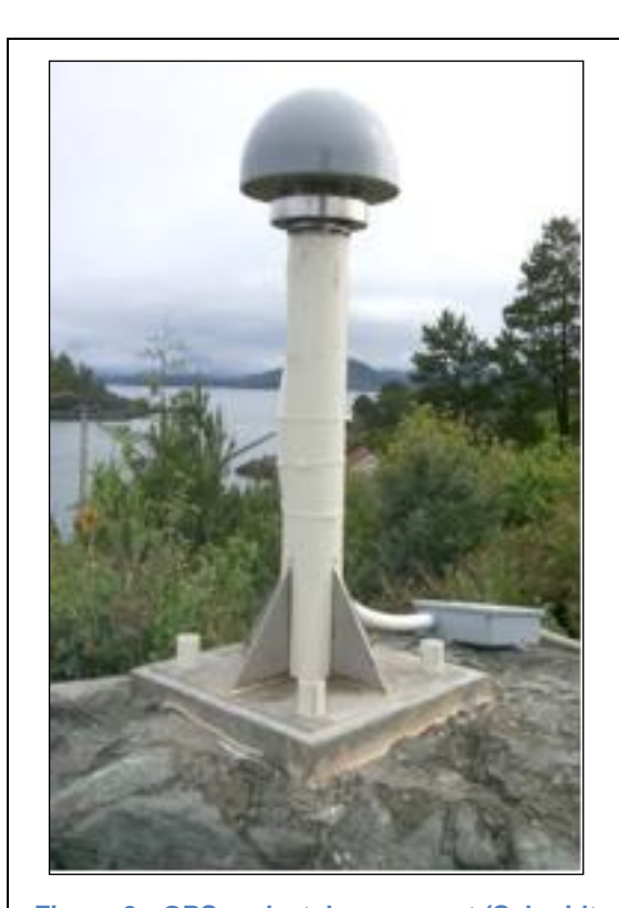
Figure 3 : GPS pedestal monument (Schmidt et al., 2000)

https://kb.unavco.org/article/unavco-resources-gnss-station-monumentation-104.html https://kb.unavco.org/category/gnss-and-related-equipment/monumentation/deep-drilled-braced/109/