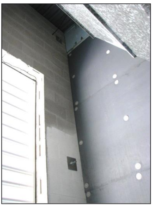
Figure 9 : Through bolts in concrete inner wall

Some locations, such as the one shown in Figure 10, necessitate some ingenuity. Nearby obstructions made the best choice for antenna location at the top of the spire. The antenna is fastened directly to structural steel.