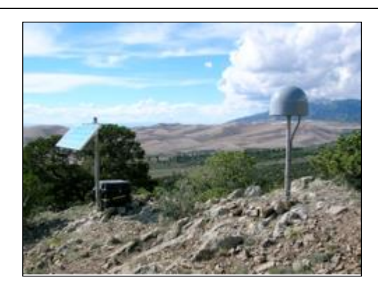
Figure 5 : Braced monument (UNAVCO, 2012)