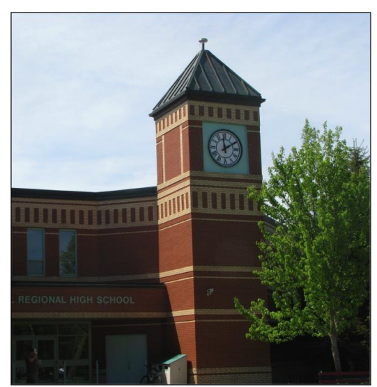
Figure 10: Spire installation

Some locations, such as the one shown in Figure 10, necessitate some ingenuity. Nearby obstructions made the best choice for antenna location at the top of the spire. The antenna is fastened directly to structural steel.