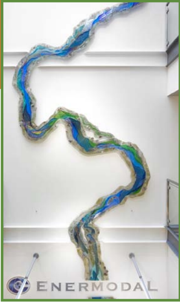
A Grander Flow by Deanna Marsh.

Other features implemented at A Grander View that contribute to the building's environmental sustainability include the following: