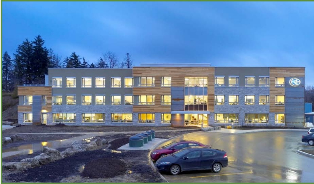
A Grander View at dusk.

and requiring neither pesticides nor irrigation. At the same time, by locating buildings in mature green spaces, builders can ensure that workplaces have a positive effect on the health and happiness of employees.