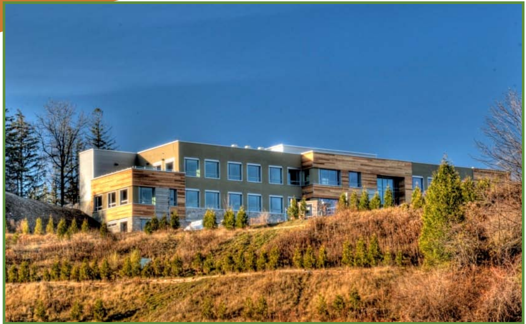
A Grander View as seen from the Grand River, Kitchener, Ontario

New Construction (NC), Commercial Interiors (CI), and Existing Buildings: Operations and Maintenance (EBOM).