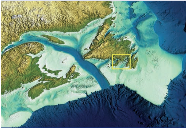
Location of Placentia Bay, Newfoundland

Placentia Bay, in Newfoundland, is an environmentally sensitive area, hosting a diverse marine ecosystem. It is fringed by small coastal communities which rely on the adjoining waters for their livelihood. It is also the scene of significant industrial activities including oil refineries, a shipyard, and a mineral refining plant. Natural Resources Canada (NRCan) is producing a new series of ocean-floor maps, based on multibeam sonar technology, a technique of reflecting many “beams” of sound off of the ocean floor to produce images. These maps will assist ocean sector industries, such as oil and gas and telecommunications, to locate safe and appropriate places to lay underwater equipment. They will also help improve fishing industry efficiency and management practices.