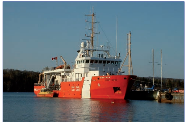
The Canadian Coast Guard Ship Matthew has a multibeam sonar system on board. It also carries two multibeam mapping launches, one of which is shown moored alongside the ship.

Currently, maps of backscatter are being made. Backscatter are acoustic signals taken from the multibeam data; when mapped, they allow researchers to analyze the sediment size on the sea floor and determine whether the ocean floor is primarily rock, gravel, sand or mud.