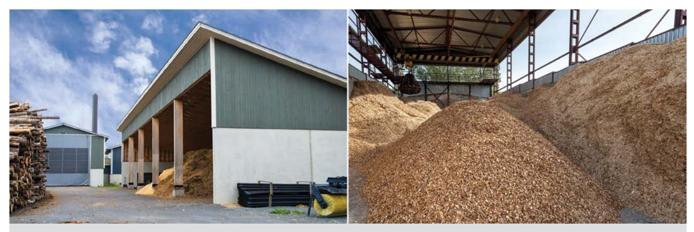
Figure 2. Covered storage for wood chip piles