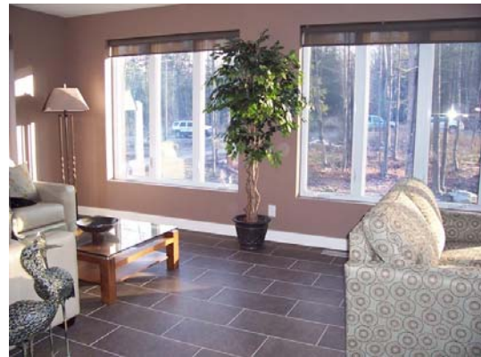
Figure 2: Concrete thermal floor mass covered with ceramic tiles

Other key healthy housing design features applied to the ÉcoTerra house are the air-tight construction and the continuous balanced mechanical ventilation. This combination provides good indoor air quality since it isolates the home from outdoor pollutants while ensuring that indoor pollutants are continuously exhausted. In this house, foam insulation material was used to increase the thermal insulation as well as to maintain the building air-tightness at 1 air change per hour (or 1 ACH) at 50 Pa. For the ventilation, the house is equipped with a balanced heat recovery ventilator (HRV). This HRV has the capacity to recover up to 76% of the heat contained in the exhaust air to transfer it to the incoming fresh air. To further contribute to minimise indoor air pollutants, the use of carpets was avoided, particularly for the flooring of the lower levels. Instead of carpeting, the concrete floor mass was covered with dark brown ceramic tiles that can be cleaned easily while allowing for the efficient absorption of the sun's heat (Fig 2).