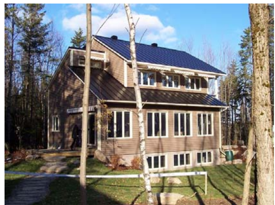
Figure 1: ÉcoTerra house in Eastman, QC

The ÉcoTerra house is a two-story detached home built on a 1.1 hectare rural lot of a new residential development located in Eastman in the province of Quebec (Fig 1).