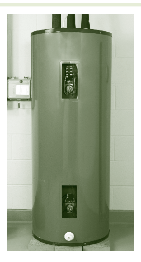
FIGURE 3 Storage tank water heater

To protect the inside of the tank from corrosion, storage tank water heaters are usually equipped with a galvanic anode. The anode is a metal rod of magnesium or aluminium alloys that is inserted into the tank from the top. The rate at which the anode dissolves depends on the mineral content or hardness of the water as well as the integrity of the enamel or epoxy coating inside the tank.