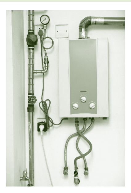
FIGURE 4 Tankless (on-demand) water heater

This type of water heater consists of either an electric element or a gas burner that heats flowing water and does not have a storage tank. It is also called on-demand, point-of-use, instantaneous or tankless water heater because it heats water only when it is needed, thereby eliminating continuous standby losses. A tankless water heater is usually more energy-efficient than a storage tank water heater.