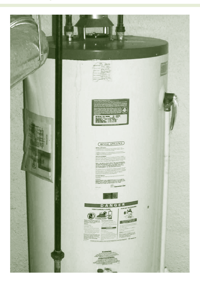
FIGURE 8 Conventional gas-fired water heater

The standard gas-fired water heater is called a conventional or naturally aspirating water heater. Its tank is