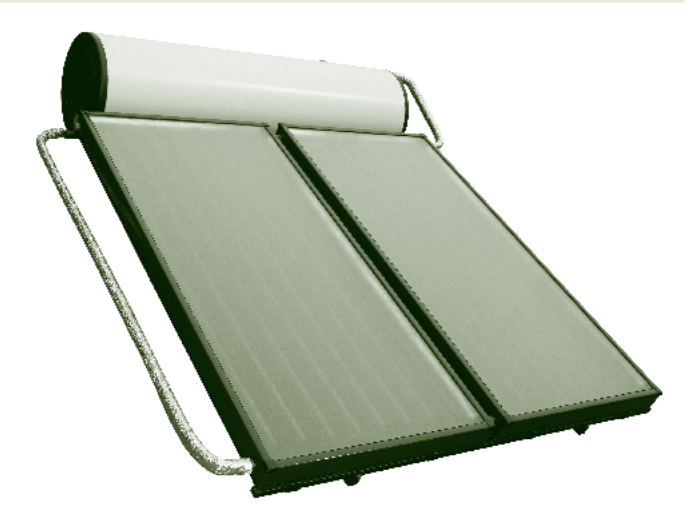
FIGURE 6 Solar domestic hot water systems