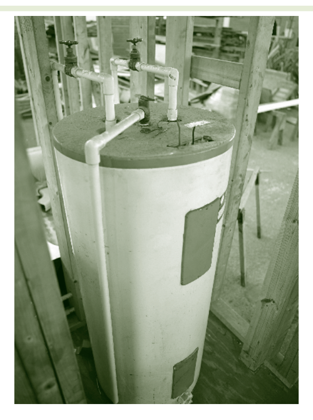
FIGURE 7 Electric water heater