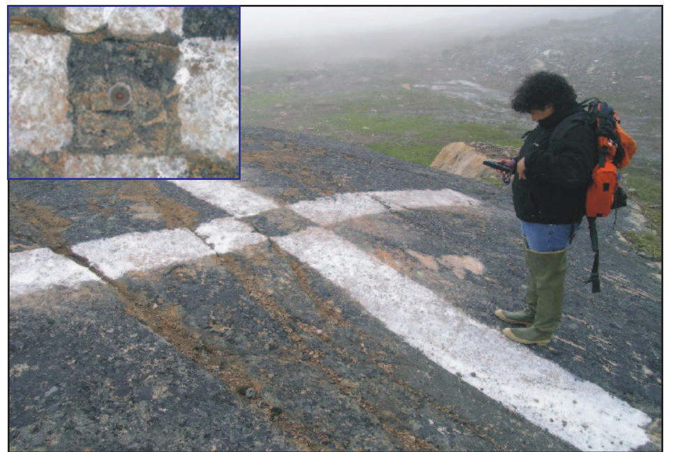
Figure 2: Several sources of ground control points were used to rectify the image, including high precision GPS and existing Geodetic Survey points characterized as painted crosses on the ground. These points will also be used for the orthorectification of a newly acquired high resolution stereo image dataset for the production of a detailed digital elevation model of the Iqaluit surroundings.