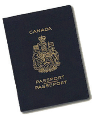
Canadian Passport (or other Passport ex: USA)